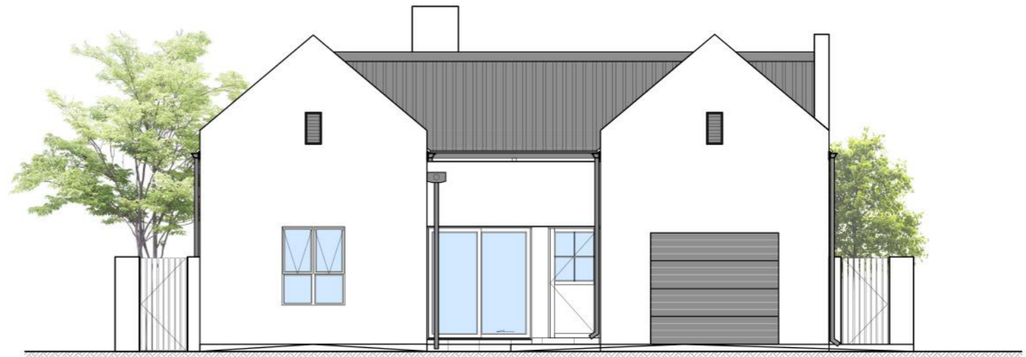
TYPICAL ELEVATION NOT TO SCALE