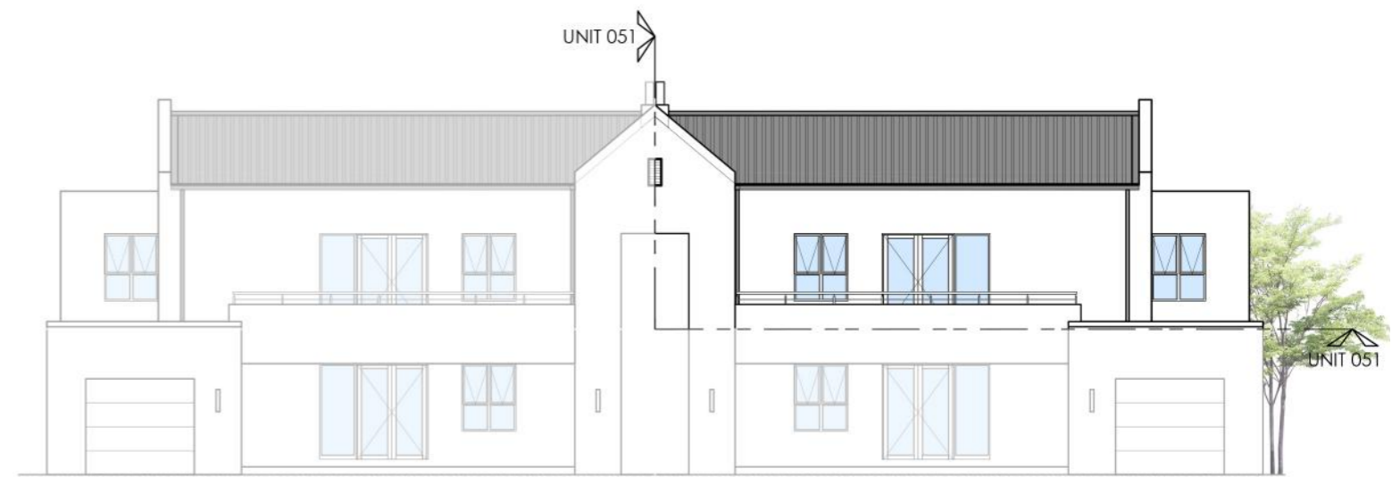
TYPICAL ELEVATION NOT TO SCALE