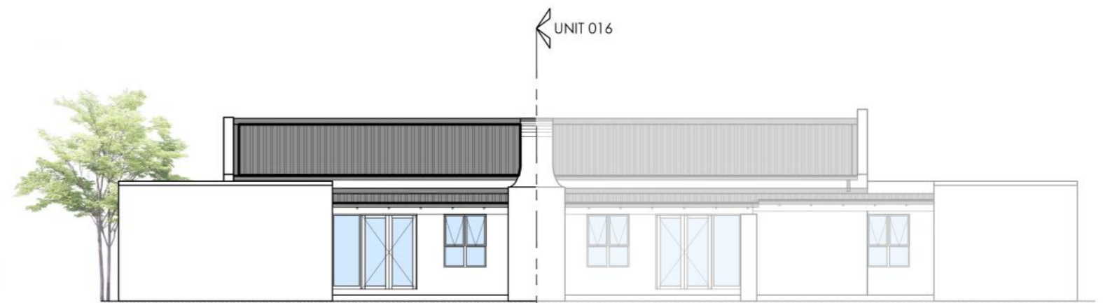
TYPICAL ELEVATION NOT TO SCALE