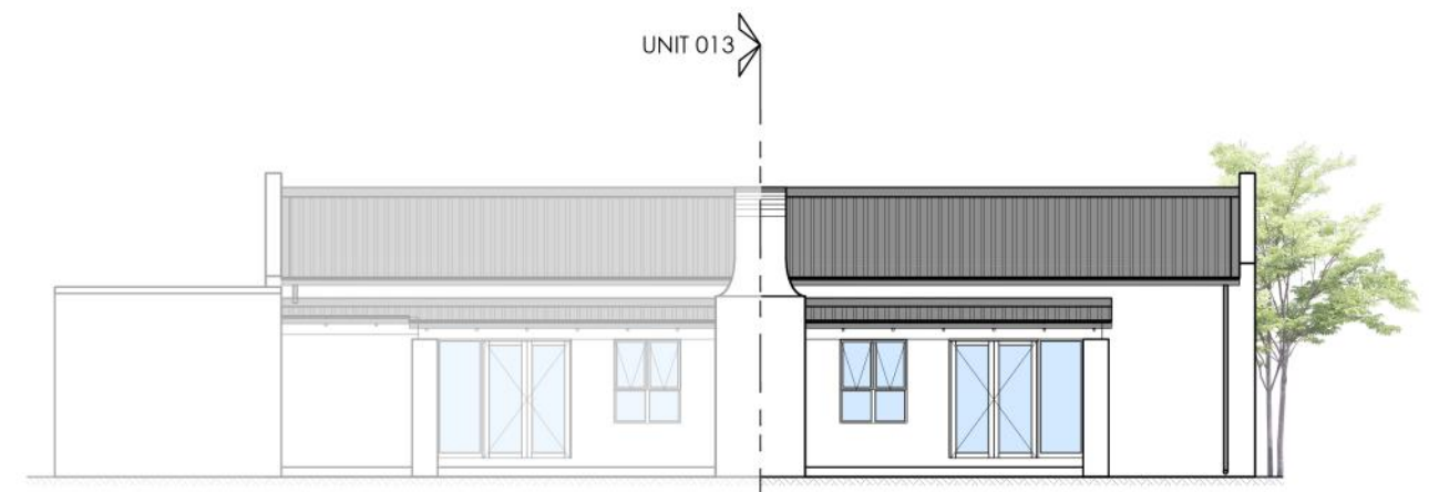
TYPICAL ELEVATION NOT TO SCALE