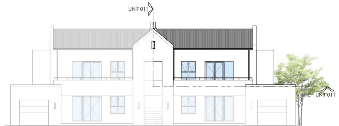
TYPICAL ELEVATION NOT TO SCALE