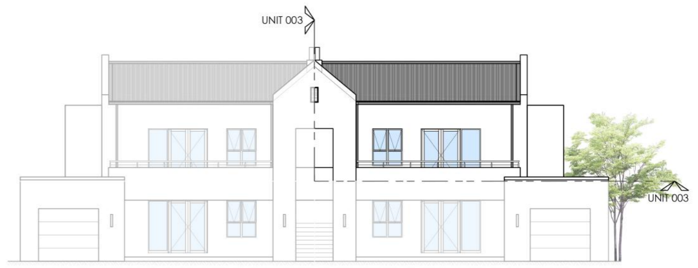
TYPICAL ELEVATION NOT TO SCALE