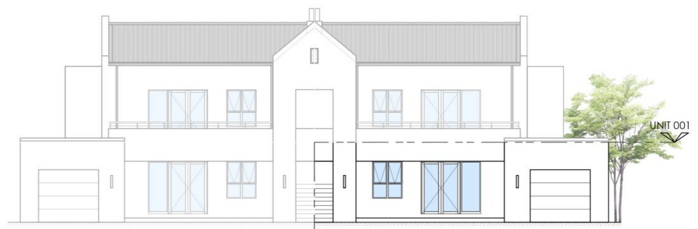
TYPICAL ELEVATION NOT TO SCALE