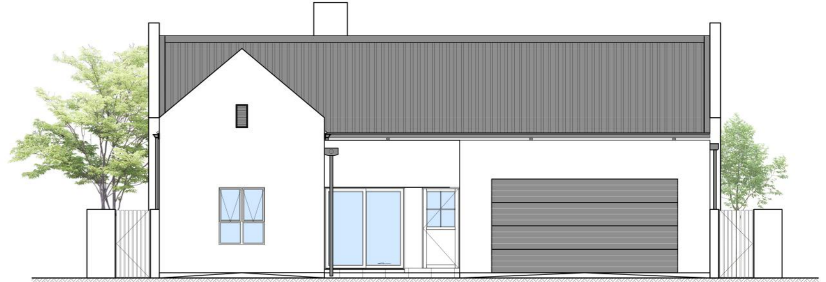
TYPICAL ELEVATION NOT TO SCALE